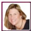
Computers/Tech Beth Sunny