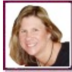
Computers/Tech Beth Sunny